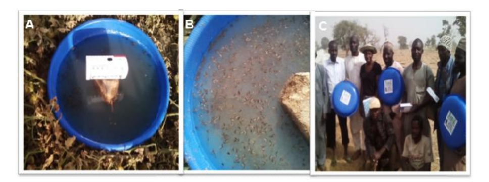
Fig. 5. Tray Trap Technique (TTT) in Nigeria A) Installed TTT System B) Dead Tuta adults captured on TTT C) TTT Distributed to Tomato Famers by NIHORT Source: National Horticultural Research Institute, Ibadan, Nigeria (NIHORT) [5,7]

light and suddenly fall into the solution and remain captive.