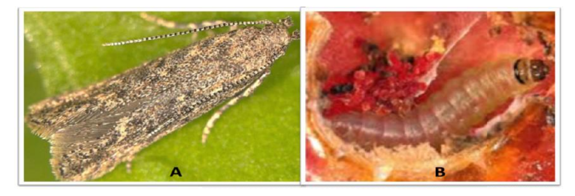
Fig. 2. (A) Adult of Tuta absoluta (B) Tuta absoluta larvae damaging tomato fruit

They undergo complete metamorphosis involving four developmental stages which include egg, larva, pupa and adult stages that are completed within 24-30 days at favorable environmental conditions [24]. The newly emerged female adults release sex pheromone that attracts the male during mating [25,26]. Females usually deposit their eggs (which are elliptical in shape, measuring up to about 1mm) on tomato leaves within 7 days of mating. The egg color varies from creamy white to bright yellow. The emerging larvae burrow into the leaves where they feed on the mesophyll tissues and develop within 7-11