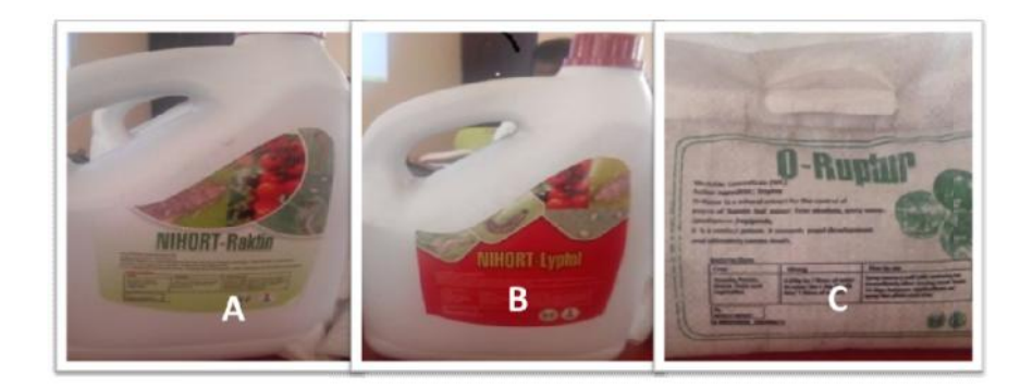
Fig. 6. Bio-pesticides for T. absoluta control developed by NIHORT A) NIHORT-Raktin B) NIHORT-Lyptol C) O-Ruptur