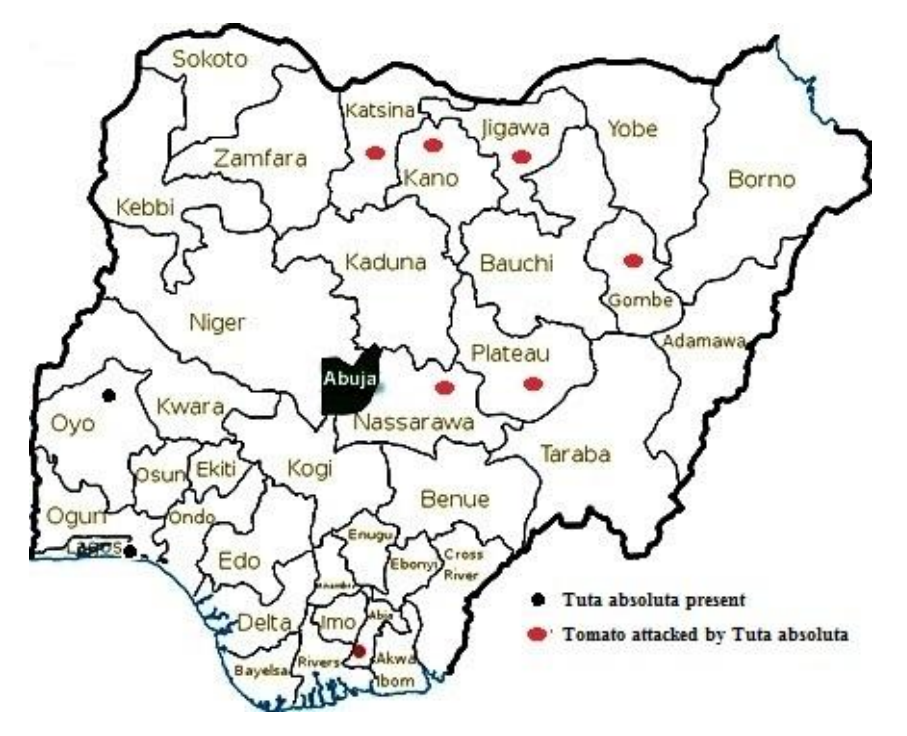
Fig. 3. Presence of Tuta absoluta and areas attacked in tomato growing zones of Nigeria Source: [3,27,28]