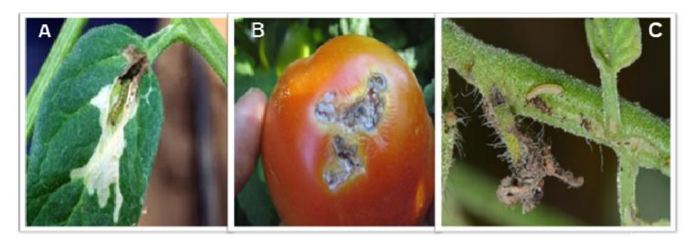
Fig. 4. Symptoms of Tuta absoluta damage on; - A) leaf B) fruit C) stem of tomato

Chemical control of T. absoluta often fails not only due to the resistance of the pest against many pesticides, but also because a big part of its development takes place inside the plant or the soil; out of reach of pesticides. A resistance management strategy for T. absoluta is critical in the search for a sustainable solution to chemical control of T. absoluta in the medium.