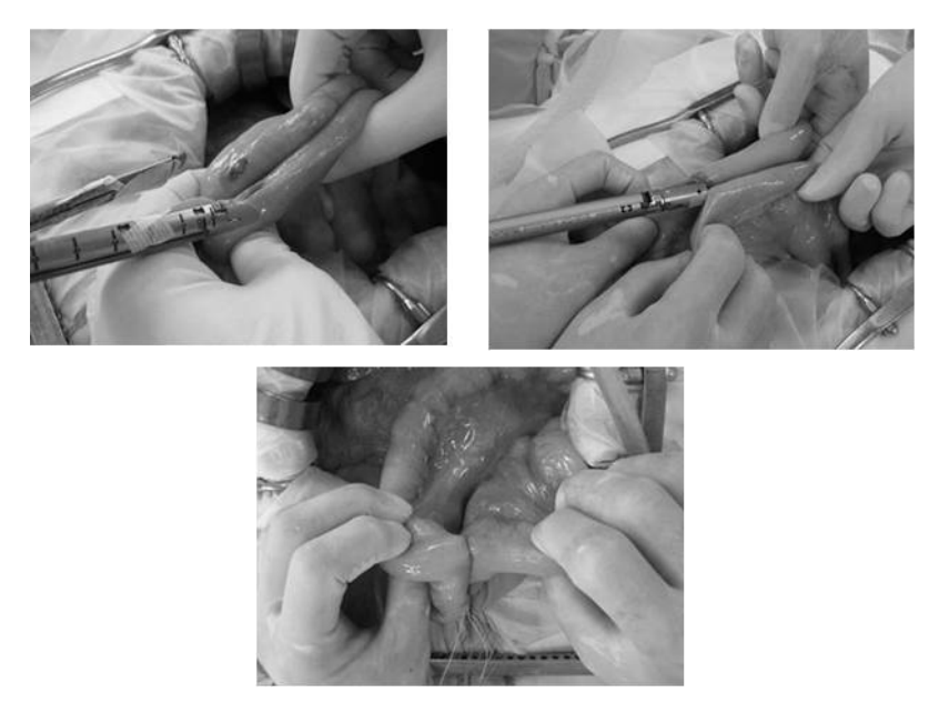
Fig. 3. Operative findings of side-to-side anastomosis by our methods

We performed side-to-side anastomoses between the esophagus and small intestine of a pig using various staplers, investigated the weak part of the anastomosis and measured the burst pressure [2]. We used the \text{GIA}^{\text{TM}} 60-3.8, the Endo \text{GIA}^{\text{TM}} 60-3.5, and the Endo \text{GIA}^{\text{60AMT}} .