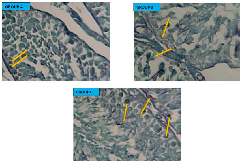
Plate 2. Transverse sections of rat testes, Feulgen DNA x 400. Yellow arrows point to the DNA stain intensity of Testicular cells. Group A is the control while B & C are the treated groups