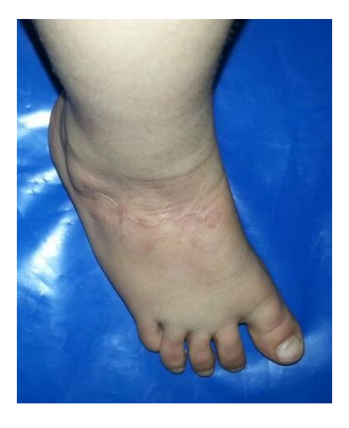
Fig. 4. Current appearance of the foot and the scar (3-year follow-up)