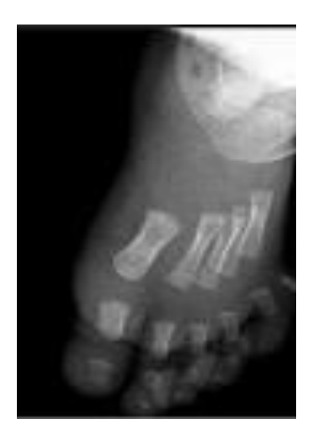
Fig. 2. X ray