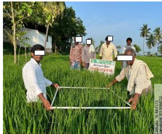
Fig. 4. Taking of Biometric Observations