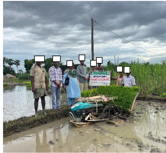
Fig. 2b. Planting of the paddy with MSRI Planter