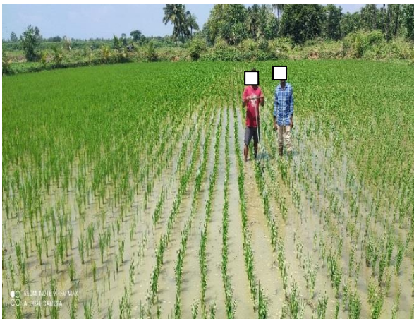
Fig. 3 . After planting with MSRI planter