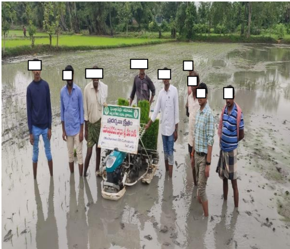
Fig. 2a. Planting of the paddy with MSRI Planter