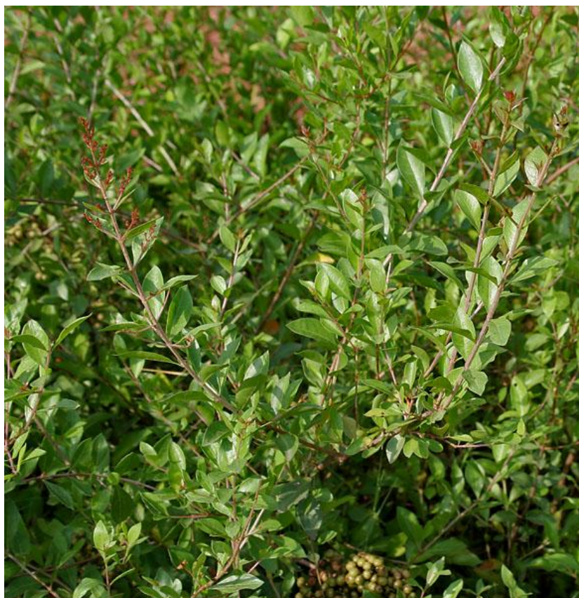
Fig. 1. Leaves of henna ( Lawsonia inermis )

On the other hand, the application of complex patterns employing henna-based preparation is called Nigār , temporary henna tattoo or Mehndi [10,20]. Some persons use it as a reminder of happiness and some use it for its aphrodisiac property. It is also worn as a form of blessing [20].