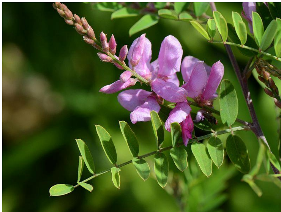
Fig. 2. Leaves of Wasma ( Indigo tinctoria )

It is also mentioned that one kind of Ghāliya , was also used for imprinting the Khāl , but the use of Ghāliya in a cosmetic context is unusual and can only be explained by the additives used such as fragrant oils, essences, etc. [10].