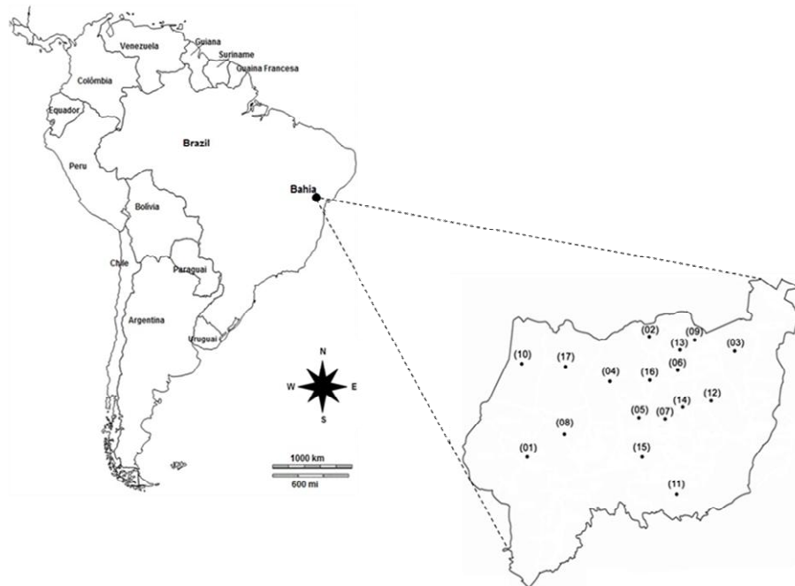
Fig. 1. Map of the Reconcavo of Bahia region (Brazil) with location of the apiaries, from where the honey samples were obtained

Samples were prepared according to Louveaux et al. [10] following the guidelines of the International Commission of Bee Botany and the International Honey Commission (von der Ohe et al., 2004). From each honey sample, a 10 g subsample was diluted in 20 mL of distilled water and centrifuged before the supernatant was drawn out. After centrifugation the pollen sediment was acetolysed following Erdtman [11] for better observation of the pollen grains. Subsequently, this sediment was mounted in microscopy slides with glycerin jelly for latter pollen grains counting and identification.