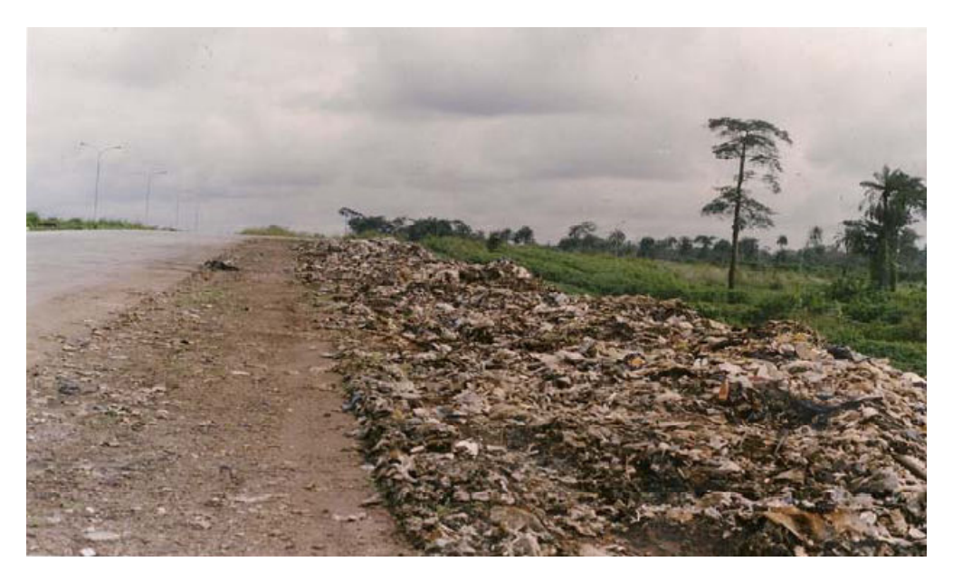
Plate 1: One of the studied dumpsites along the link road in Benin-City, Nigeria

As far as pollution of the environmental multi-media by dumpsite leachate is concerned, leachate quality deserves careful scrutiny and analysis to prevent further damage to the environment. It is also essential to understand characteristics of the various types of dumpsite leachate for proper treatment and disposal. Hence, the aim of this paper was to determine dumpsite leachate composition, through physico-chemical and elemental analysis and estimate its polluting effects on the environment and look for cost effective way of treating before disposal. In Benin-City, Nigeria, most people are not aware of the health implication of living close to dumpsite, planting close to dumpsite and eating fruits and vegetable from dumpsite. Plate 1 shows one of the dumpsites in Benin-City close to a farmland and major road.