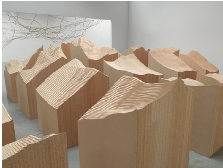
Figure 7. Blue Lake Pass (Pace Wildenstein Gallery, New York, 2009).