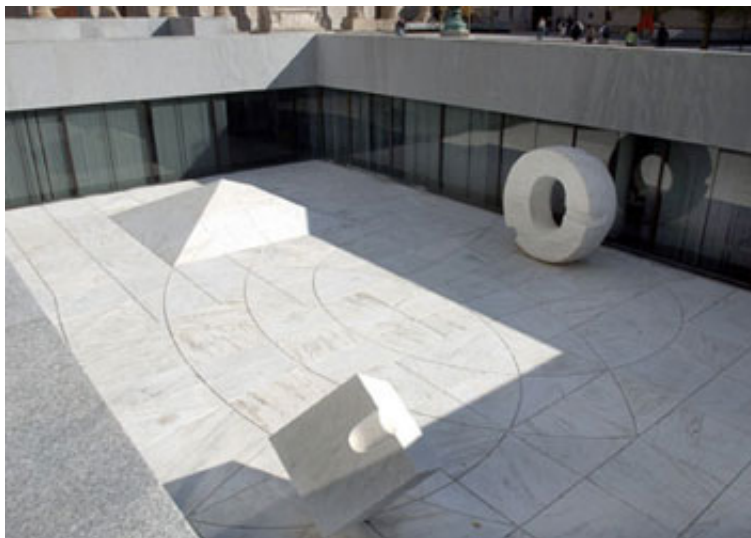
Figure 8. The Garden (pyramid, sun, and cube), 1963, location: Hewitt university quadrangle (Beinecke Plaza).

Library in one of several collaborative efforts with architect Gordon Bunshaft (1909-1990) who was among the first American architects to embrace European Modernism tradition. Garden extends to the library's paneled walls and its sunken courtyard is covered with creamy Vermont marble. And it evokes a contemplative mood. The cold materials of the space inspire not emotion but contemplation, reinforcing a studious atmosphere in the adjacent underground reading room. The mood seems to be similar to that of a Japanese Zen garden 8 , quietly balancing cosmic forces symbolized by the circle filled with sunlight and its energy, the pyramid characterizing the ancient history of the earth. This synthesis of Eastern and Western mood also unites past and future. His ultimate objective is to create and enhance public spaces through sculpture beyond individual space. Although Noguchi's sculptures began as simple geometric shapes, he soon moved toward more organic forms. In the end he merged geometric and organic forms. For him, gardening is considered as sculpturing of space for contemplation. His sustainable gardening work makes it possible to achieve the harmonious existence between man and