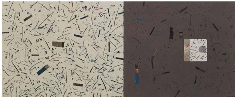
Figure 5. Primitiveness + child's mind, 2008 (mixed media on Canvas 60.6 × 145.4 cm).

origin. The author hopes that Hongtae Kim's works of art will give us the motivation to suggest a vision of contemplation and healing opportunity in contemporary Korean art 7 .