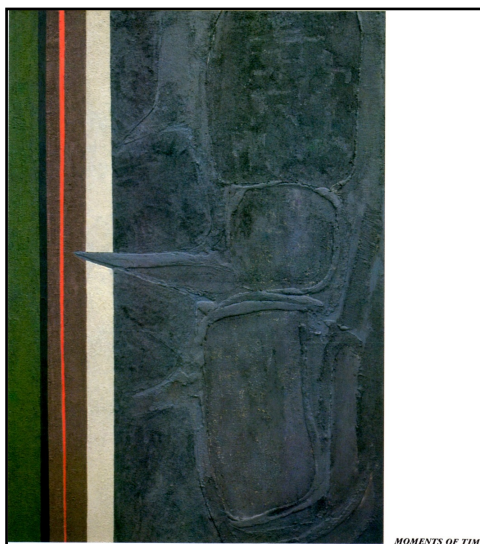
Figure 4. Rita Deanin Abbey: mixed media on canvas, 70 × 50 inches.