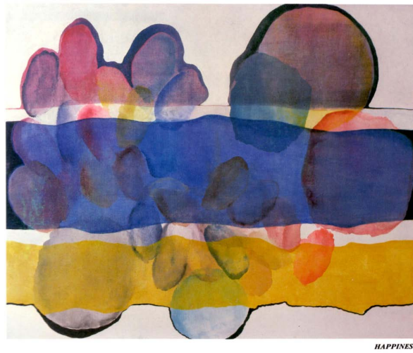
Figure 2. Rita Deanin Abbey: 1977, acrylic on canvas, 50 × 70 inches.