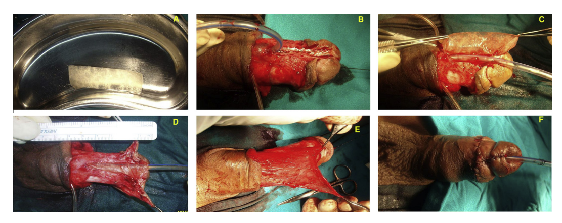
Figure 1 (A) The gross appearance of the SIS graft; (B) penile skin degloving through a subcoronal incision, preserving the urethral plate; (C) suturing of SIS graft to the urethral plate in an onlay fashion; (D) completed onlay SIS graft suturing; (E) splitting of the dartos flap into two halves to form the second layer of coverage for the graft; (F) the final postoperative appearance.