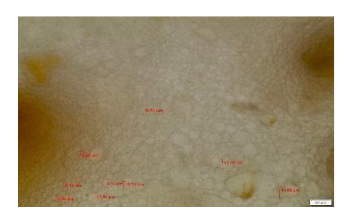
P2= Addition of avocado seed flour 2%