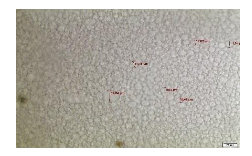
P1 = Addition of avocado seed flour 1%

Microscopic observation of reduced fat mayonnaise emulsion droplets was carried out using an Olympus Bx 40 Microscope. The different percentage of avocado seed flour addition will produce different emulsion droplets. Droplet emulsion of reduced fat mayonnaise is presented in Fig. 1.