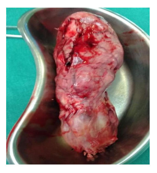
Fig. 2. Right high orchidectomy specimen