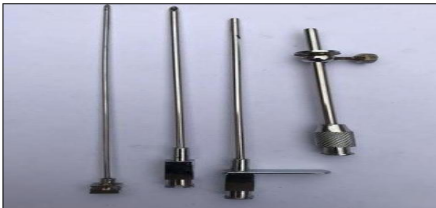
Fig. 2. Cope's needle

The Abram's needle (Fig. 3) is made of three components: 'a large outer trocar, an inner cutting cannula, and an inner solid stylet'. The Abrams needle, which is popularly used in Europe, has a sturdy framework and a biting technique that allows for sufficient tissue samples. Drawbacks of this needle include (1) its large size that may cause a sinus tract to leak fluid for long periods of time, (2) a faulty hooking method, and (3) entire device removed with each biopsy attempt.