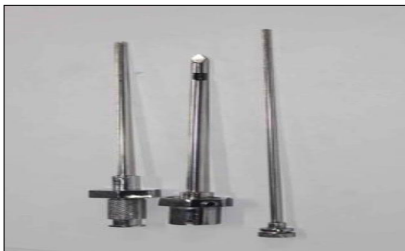
Fig. 3. Abram's needle