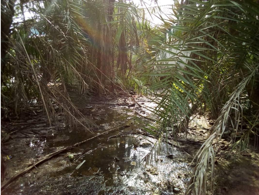
Fig. 2. Plate showing one of the sampling locations (Iwofe) impacted by crude oil pollution/spillage