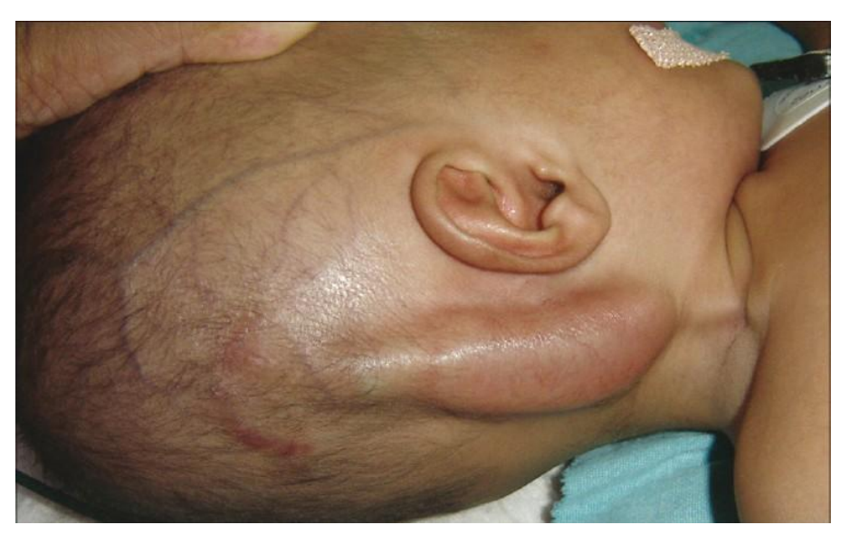
Fig. 3. CSF collection under the skin at the site of parieto-occipital burr hole