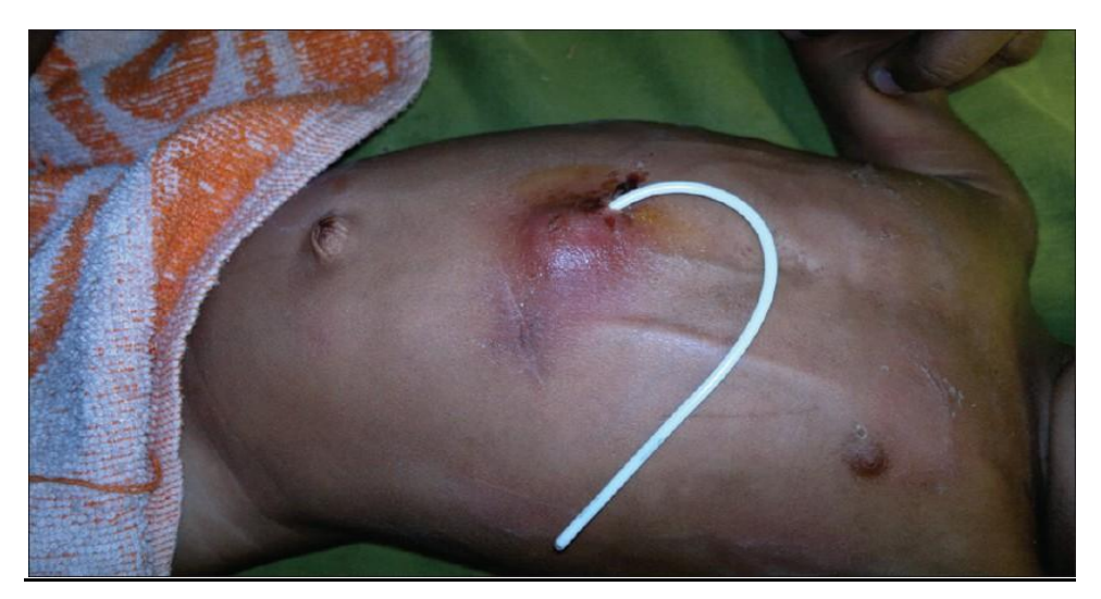
Fig. 5. Distal catheter exposure