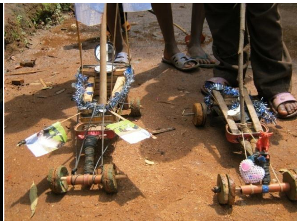
Fig. 6. Meta children's creativity in craft