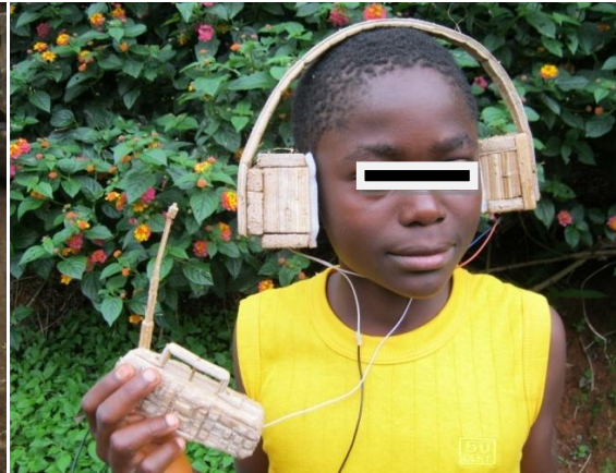
Fig. 3. 10-13 year old Meta boys' creativity in craft