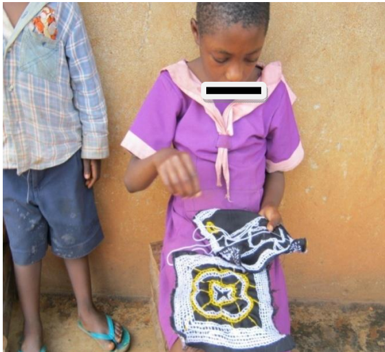
Fig. 4. 6-9 year old Meta girls' creativity in craft