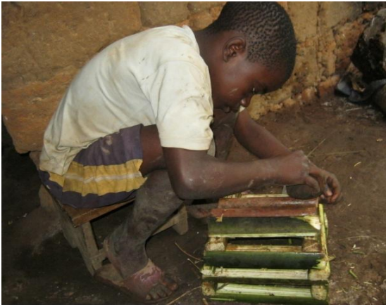
Fig. 2. 6-9 year old Meta boys' creativity in craft