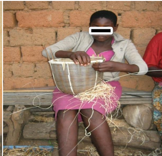
Fig. 5. 10-13 year old Meta girls' creativity in craft